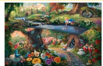
Years 7 and 8 'Alice in Wonderland' Friday 23 June (7pm)