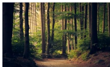
Year 9-12 'DNA' by Dennis Kelly Thursday 22 June Act 2 (after interval)