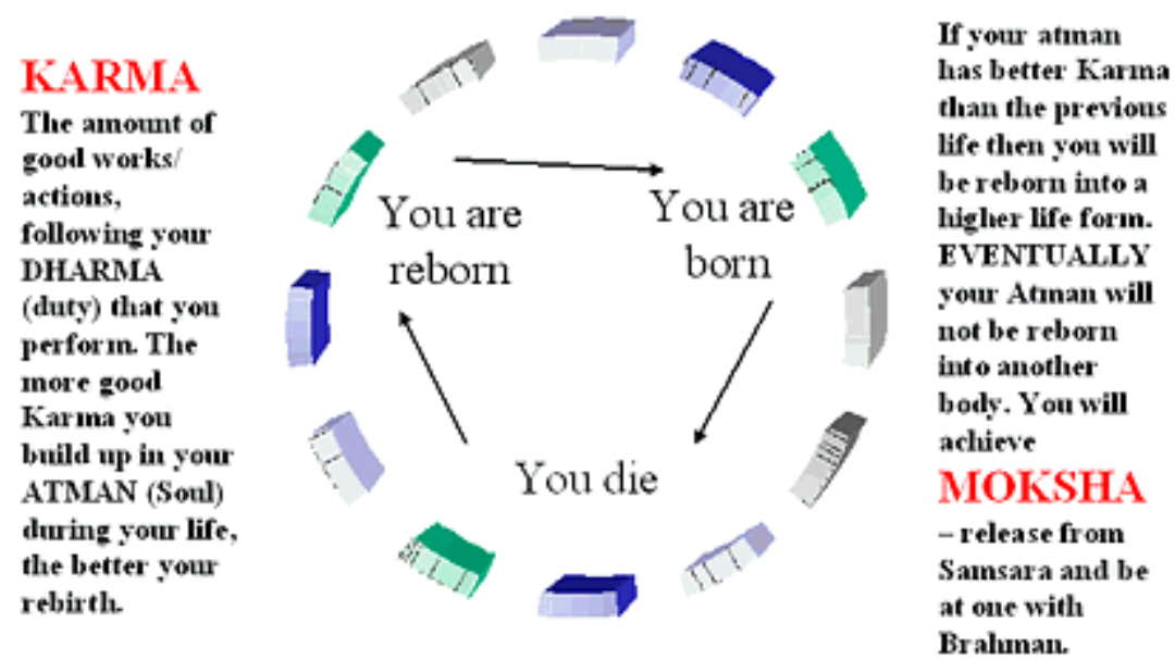
A continual cycle of birth-death-rebirth